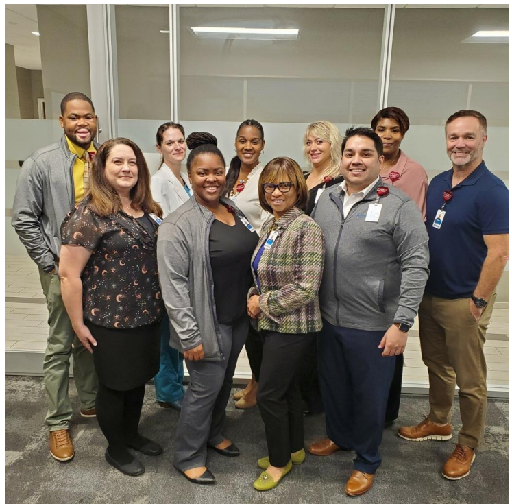
AdventHealth Community Care Team

*Total patients served for Orange, Osceola and Seminole County in 2019